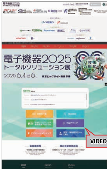
VIDEO PR AD *sample