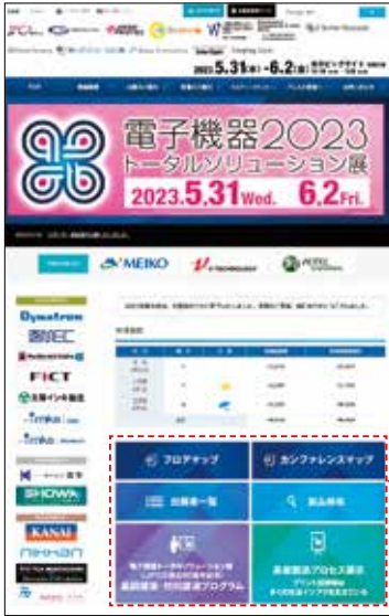
VIDEO PR AD *sample